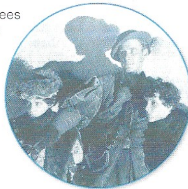
In one film adaptation of The Prince and the Pauper , twins Billy and Bobby Mauch played the roles of Tom and the Prince.