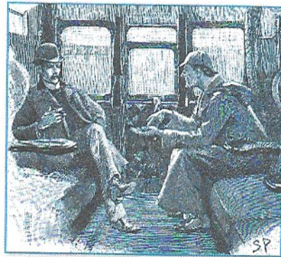
Sherlock Holmes is perhaps the world's most famous and recognizable fictional detective.